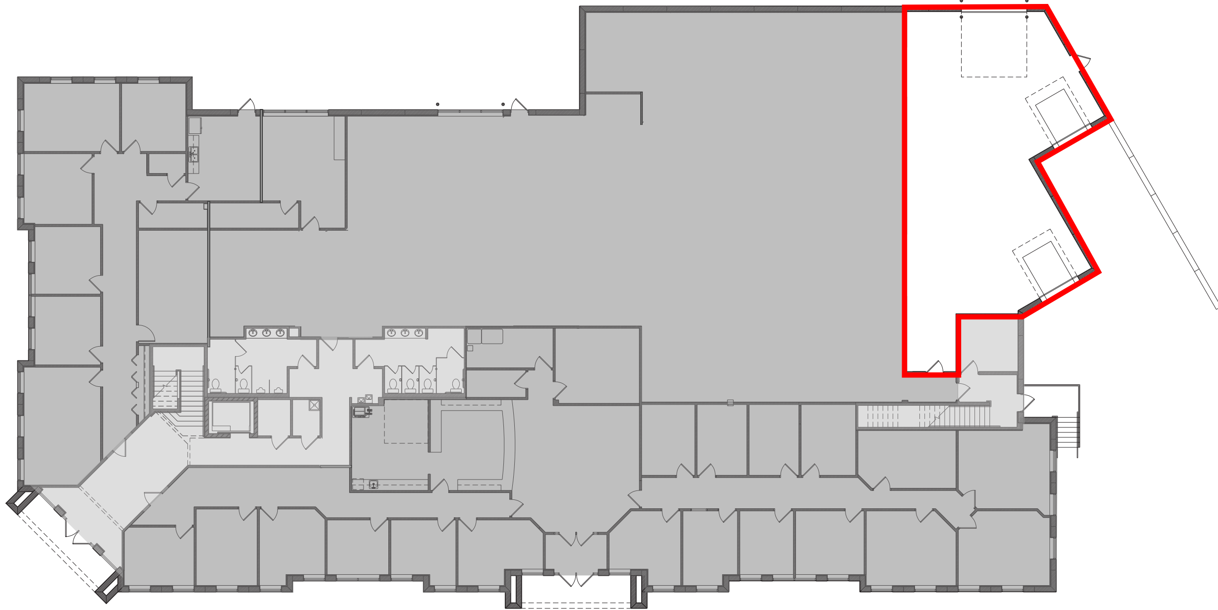
1 1st FLOOR PLAN SCALE: 1/8" = 1'-0"

Filename: R:\Software\Leaseholds\2970 Master Plan - 1st Floor.dwg